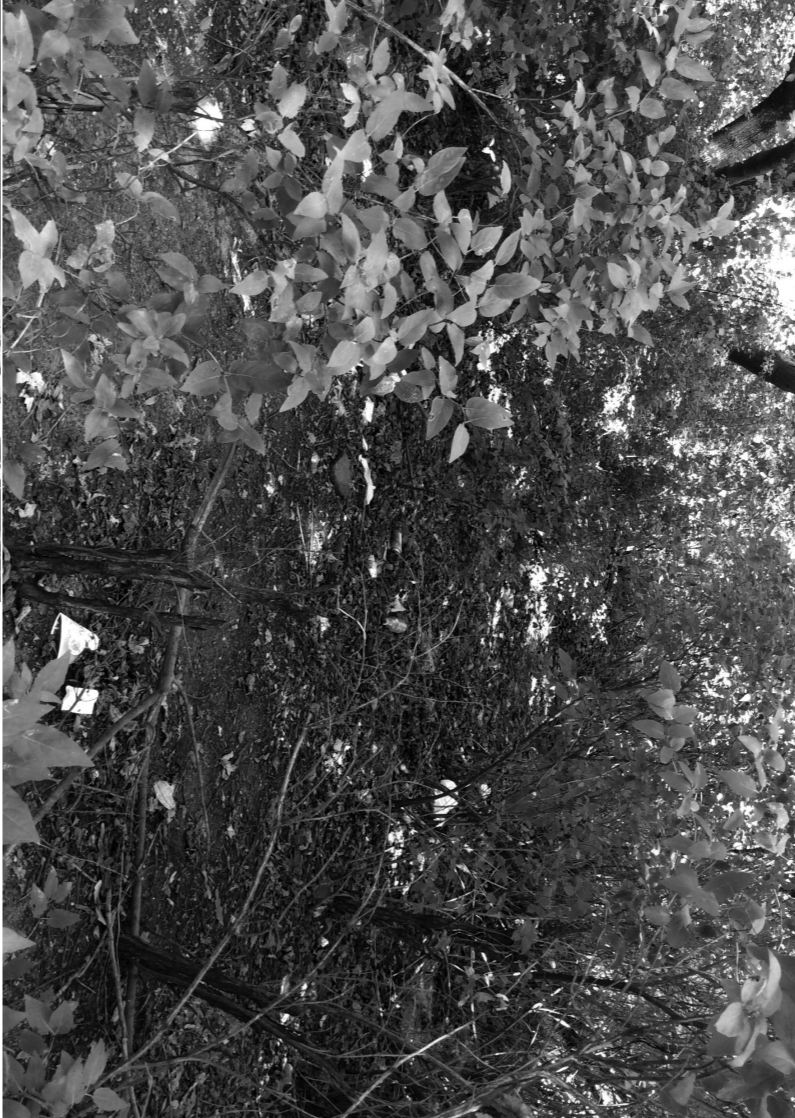
Against Architecture: The Writings of George Bataille, 1974 (1989), MIT Press

The city has not gone away. The clean workspaces and the monumental museums, the public streets turned into shopping malls, merely conceal the city's re-orientation. It is turning itself inside out, growing, sprawling. At the truck stop they have just killed a goat. The prostitutes are cooking it in pieces on an Aldi disposable barbecue while the truckers engage in oral sex beneath the motorway.